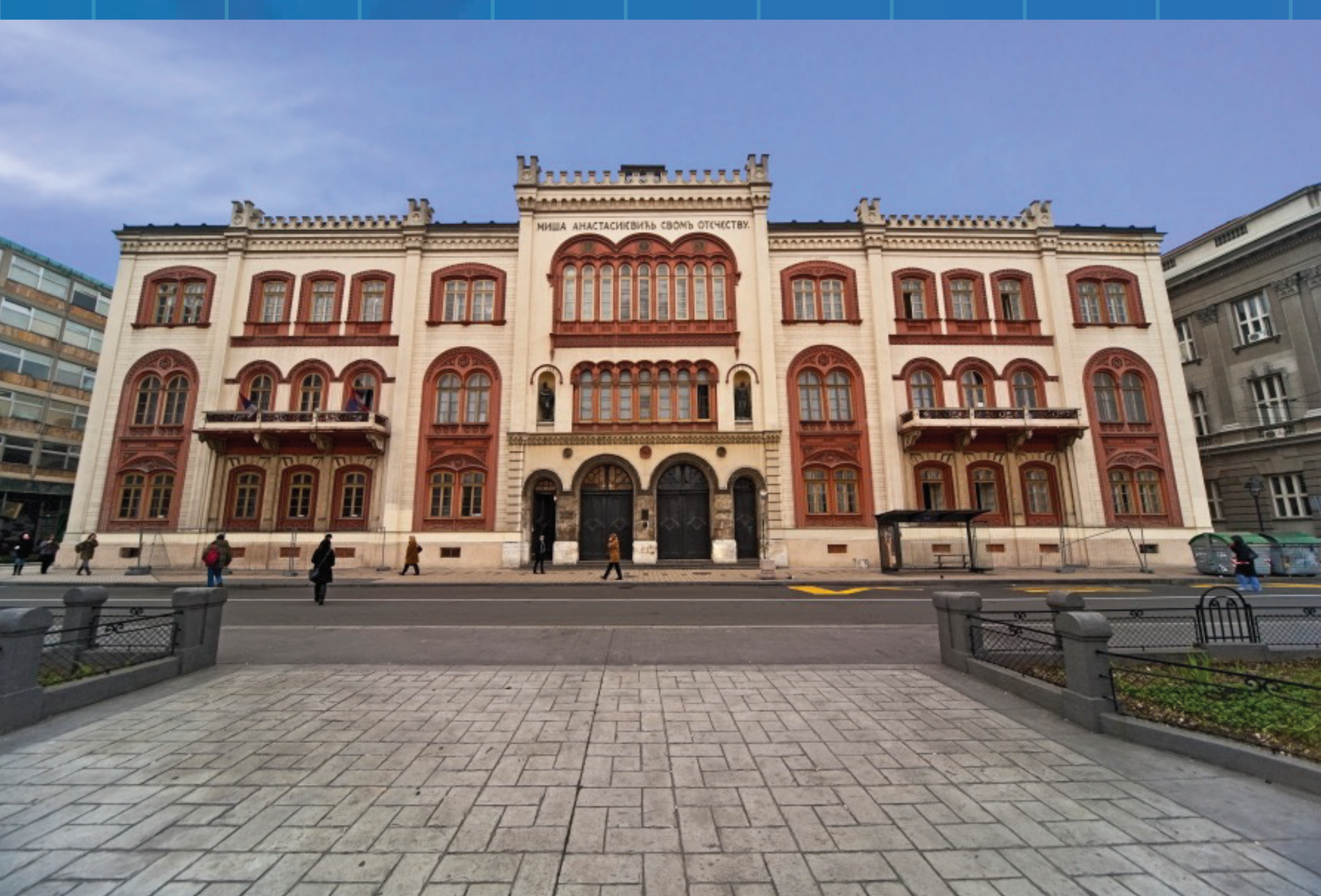
University of Belgrade, Serbia www.bg.ac.rs