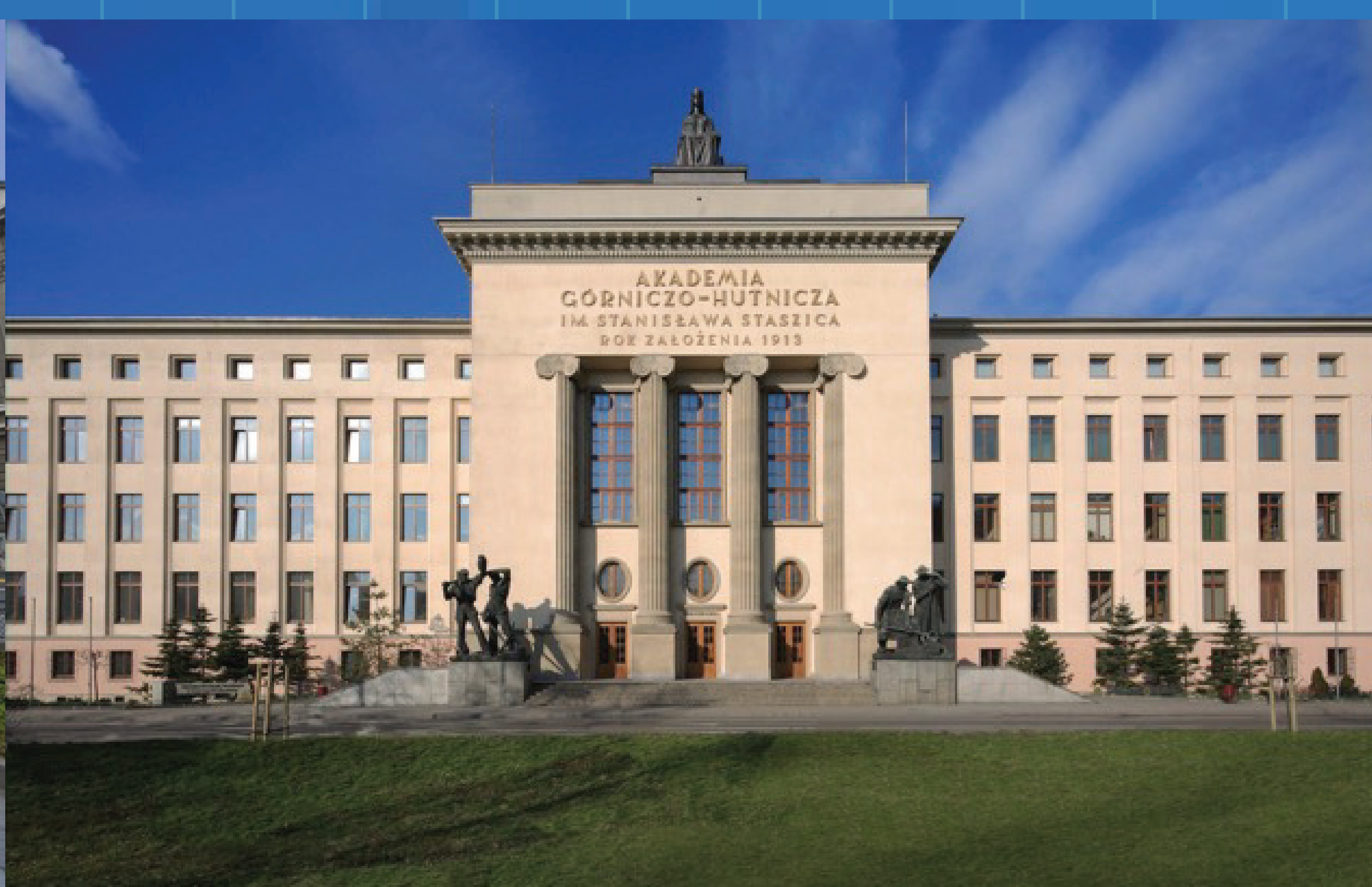
The AGH University of Science and Technology in Krakow, Poland www.agh.edu.pl