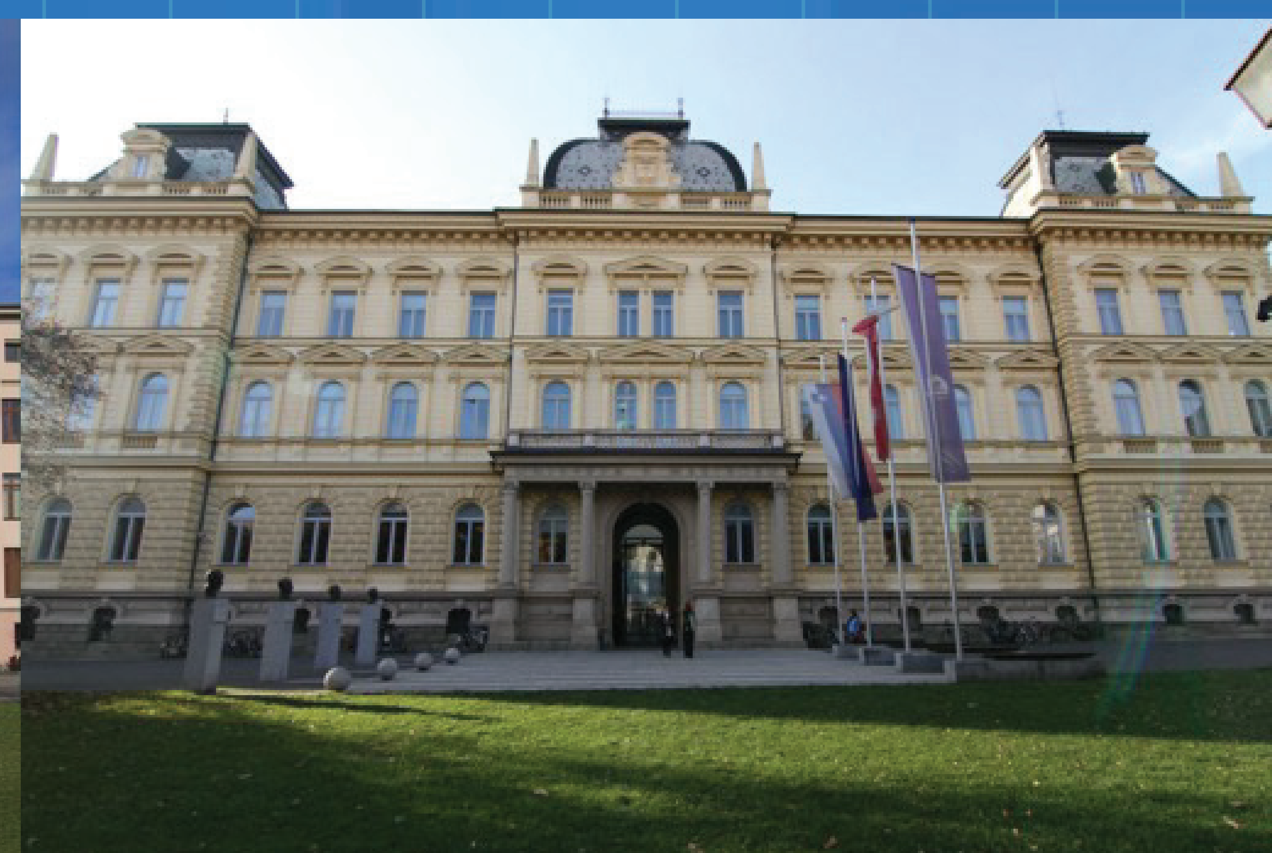
University of Maribor, Slovenia www.um.si

StudES website: studes.studije.rect.bg.ac.rs StudES LinkedIn: www.linkedin.com/company/74518673